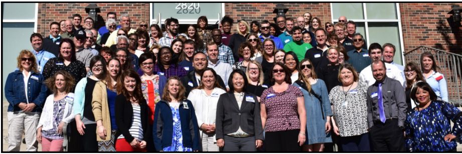
Attendees at the IEHA Annual Spring Educational Conference take time out for a photo.